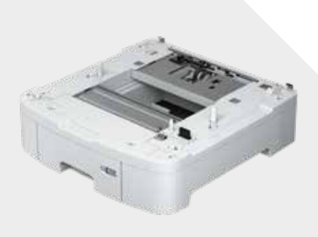
Up to two-sheet paper cassette