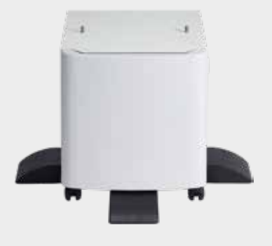
High Cabinet - only available for 6000 series