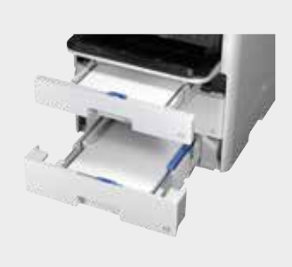
500-sheet paper cassette