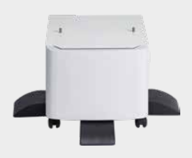
Low Cabinet - only available for 6000 series